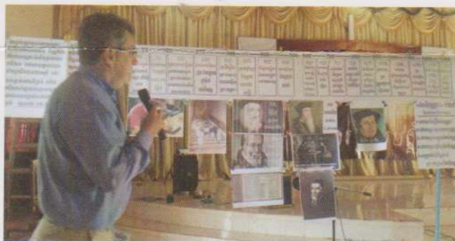
This is the first time most of the students have studied history and geography.